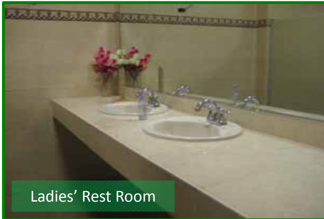
Ladies' Rest Room