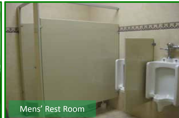
Mens' Rest Room